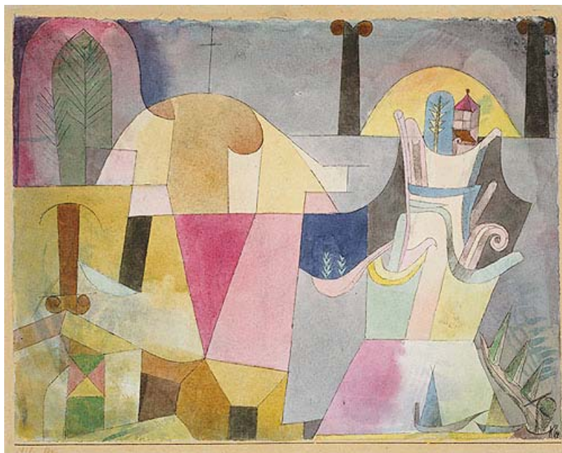
Black Columns in a Landscape, 1919 Watercolor, pen, and ink on paper 20.4 x 26.3 cm

Not only did Klee's work help define modernism but the context and time period in which he made his art has historical significance as well. Shortly after in 1915, he returned from his trip to Tunisia, where he was conscripted into the German army to fight in WWI. The deaths of his fellow artist August Macke and Franz Marc deeply affected him. He continued to make art while serving in the army where much of the work is centered on the theme of death.