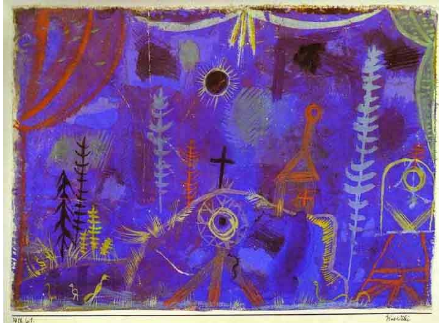
Hermitage. 1918. Watercolor on chalk ground. 18.3 x 25.4 cm

In 1914, Paul Klee visited Tunisia in North Africa and was overwhelmed with the color created by the light of Mediterranean Sea and at that time he was quoted as saying “Color possesses me. I don't have to pursue it. It will possess me always, I know it. That is the meaning of this happy hour: Color and I are one. I am a painter.” (1914, Klee) As a result of his trip, Klee's work started to become more abstract.