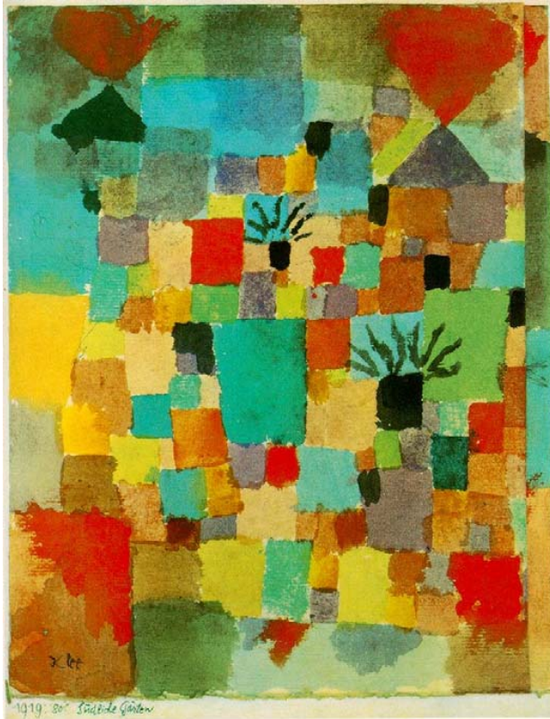
Paul Klee - Southern (Tunisian) Gardens, 1919 Watercolor 81 x 66 cm

“My hand is entirely the implement of a distant sphere. It is not my head that functions but something else, something higher, something somewhere remote. I must have great friends there, dark as well as bright... They are all very kind to me.” (Klee)